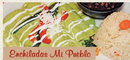
Enchiladas Mi Pueblo

Three enchiladas stuffed with grilled chicken and spinach topped with shredded cheese, salsa poblana, sour cream, queso fresco, and roasted poblano pepper. Served with white rice and black beans. • 13.99