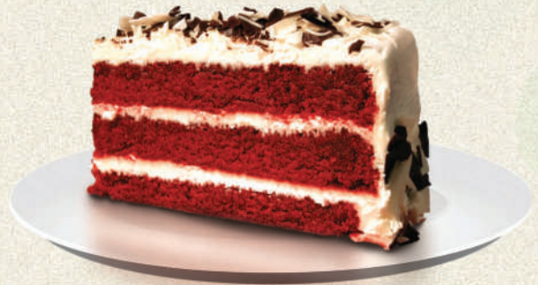
Red Velvet Cake

Layer upon layer of moist carrot cake studded with raisins, walnuts and pineapple. Finished with smooth cream cheese icing and a drizzle of white chocolate ganache. • 5.95