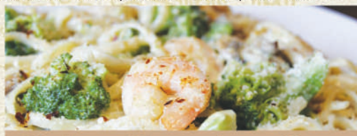
Chicken or Shrimp Agaves Pasta

Linguine with cheese and homemade creamy white sauce, garnished with shrimp or chicken or mixed, and broccoli. Chicken • 14.99 | Shrimp • 15.99 | Mix • 15.99