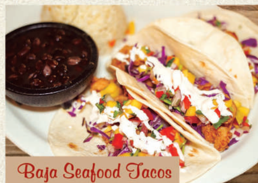
Baja Seafood Tacos

(*) COOKED TO ORDER: CONSUMING RAW OR UNDERCOOKED MEATS, POULTRY, SEAFOOD, SHELLFISH OR EGGS MAY INCREASE YOUR RISK OF FOODBORNE ILLNESS, ESPECIALLY IF YOU HAVE A MEDICAL CONDITION.