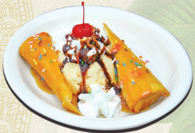
Cheesecake Chimichanga • 5.99

Traditional Mexico city style creme caramel. • 4.99