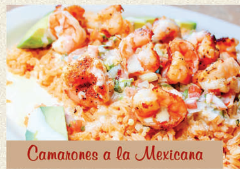
Camarones a la Mexicana