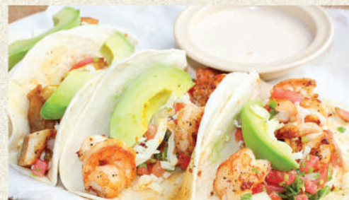
Special Fish or Shrimp Tacos