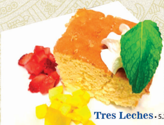
Tres Leches • 5.25