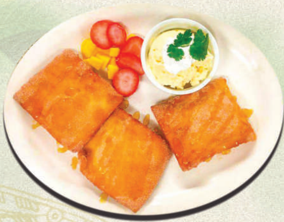
Sopapilla • 5.99