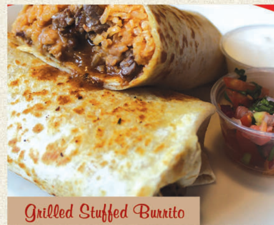
Grilled Stuffed Burrito