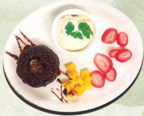
Chocolate Lava Cake

A moist chocolate cake with molten chocolate center, served with rich vanilla ice cream. • 5.99