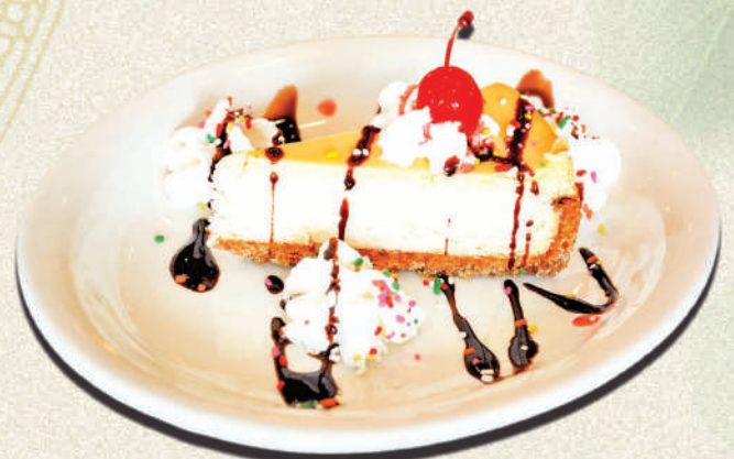
Cheesecake • 5.99