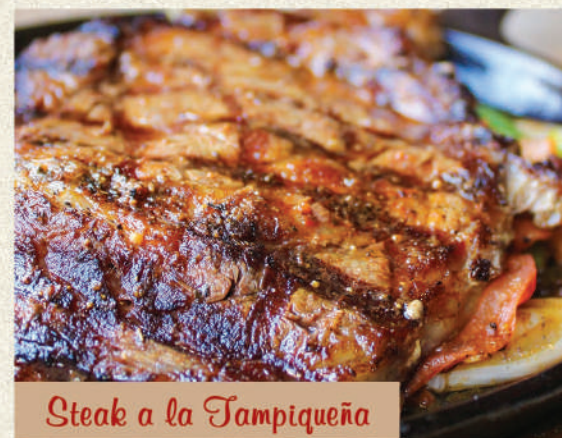
Steak a la Tampiqueña

Grilled chicken, steak, shrimp or pastor 1.00 extra