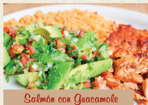
Salmón con Guacamole