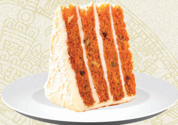
Four High Carrot Cake

A moist chocolate cake with molten chocolate center, served with rich vanilla ice cream. • 5.99