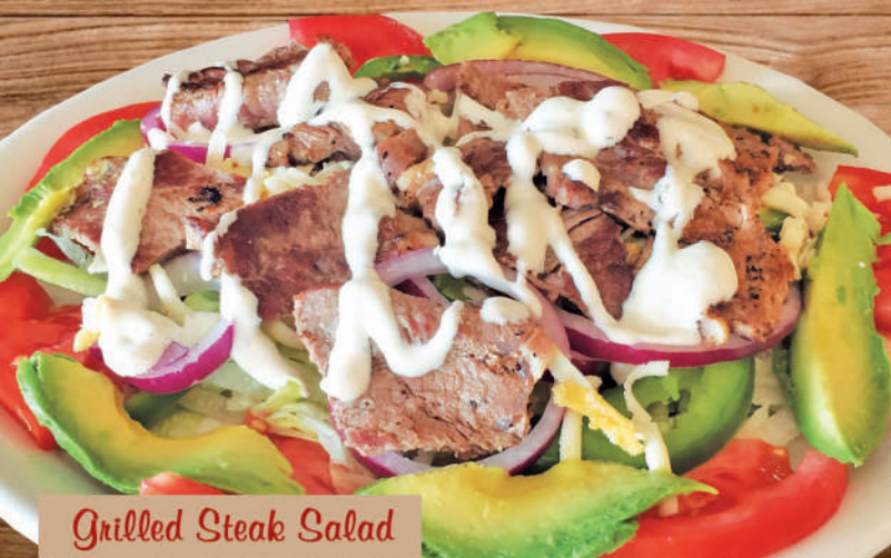
Grilled Steak Salad